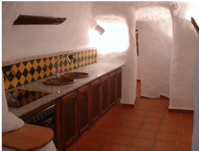
This internal kitchen has well concealed forced external ventilation.