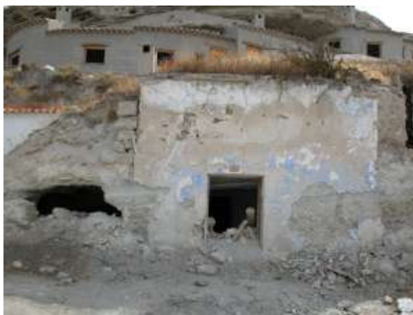
Very new and very old

On the coast it is a lot easier to find houses and apartments for sale without using an estate agent, as just about everybody speaks English. Many people don't like using agents because they think they are too expensive or have had a bad experience in the past. All you need do is find an area you like and drive or walk round taking note of the "Se Vende", signs and telephone numbers and then ring them up. If you like the property and price find a lawyer or abogado to act for you and away you go.