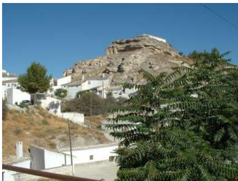
Galera's Little Chapel on the Hill.

Not all caves were abandoned, a good percentage continued to be the main residence of many people, while others became fine holiday homes for those working in the cities and on the coast.