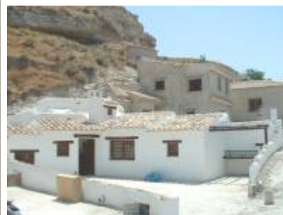
A fully renovated three bedroomed cave house.

Fully Renovated. These have been totally restored and renovated with the foreign market in mind. Generally they will have had additional rooms built onto the front of the cave for extra space and light. The old cave rooms will have been excavated to provide additional height, all rooms will have tiled floors. The cave will have been totally rewired to current standards and completely replumbed for bathrooms, ensuites and kitchens. Many decorative features such as beamed ceilings, uplighting and various nooks and crannies will have been incorporated to improve appearance. Modern wood burning fires will have been installed. All rooms will be accessible internally. In short they will have many of the features you would like to find in a modernised English country cottage. Typical prices range from 55,000 for a single bedroom holiday property up to 200,000 Euros for a three bed with swimming pool etc.