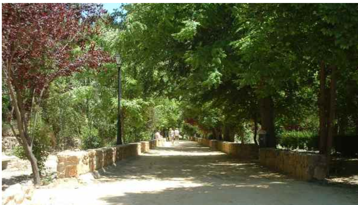
A beautiful spring walk in Castril

Moving to Spain is a big step but there is an old chestnut that says a Brit arriving in Spain leaves his brains at the airport. Don't be one of those, do your research and homework before you step foot on the plane. Living in Spain is not an extension of all those many holidays that you have had in years gone by.