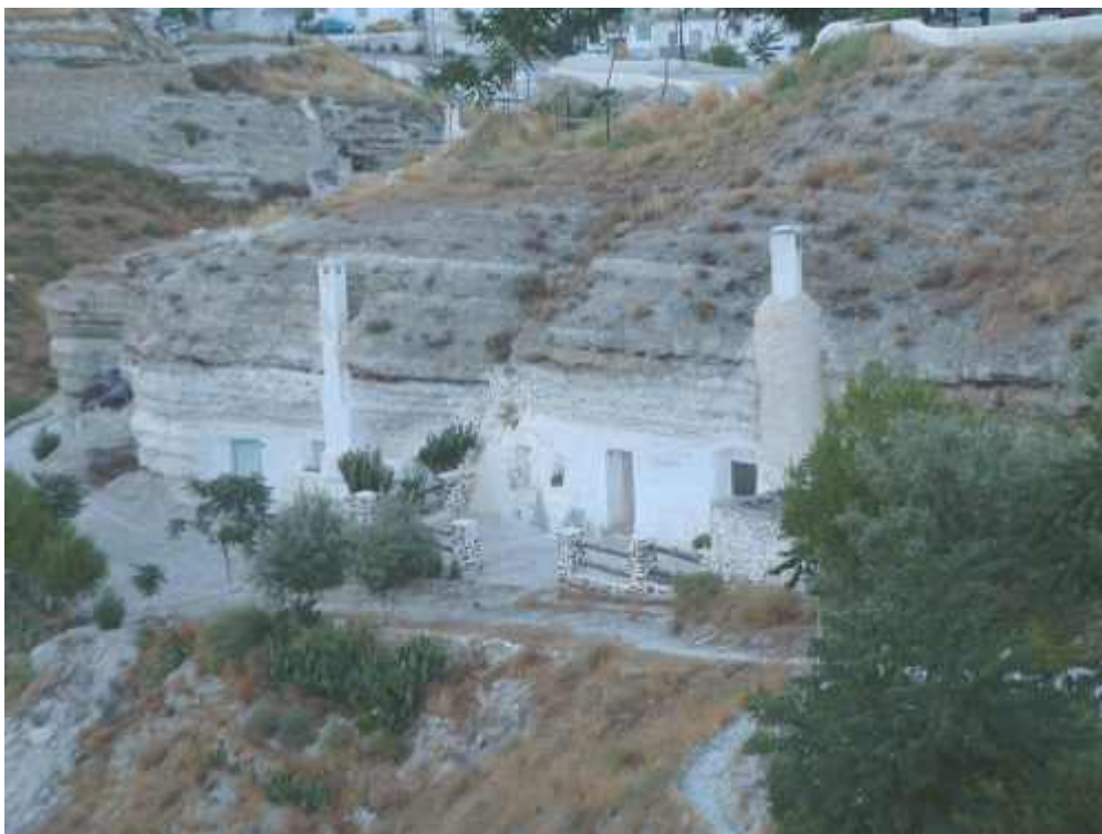
You can find these lovely but unreformed cave homes in Galera

In the cave homes of forty years ago you would not find any of the modern conveniences we take for granted. In those days caves homes did not have running water or sewerage and the only electrical supply, if any, was a low power, 125 volt lighting circuit, literally pinned to the cave walls. Tiled floors were unheard of, the floors mainly being made up of compacted earth or possibly some kind of "yeso"/cement mixture. Typically the ceilings of old caves were quite low, sometimes making them feel a little claustrophobic.