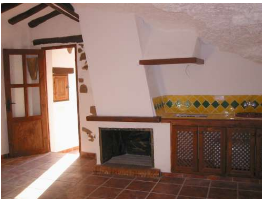
A living room in one of the holiday caves

In Spain there are no effective controls on estate agents or any other business or individual selling property and so it is very much a case of " Caveat Emptor " or let the buyer beware.