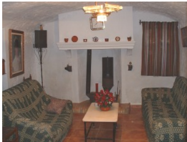
A living room in traditional Spanish style.

If you are going to seek independent advice it is preferable to have your advisor in place before you sign a contract or pay over any money as a deposit (usually non refundable). There is no reason why you should not have found your gestor or abogado before you go to Spain on your property hunting trip.