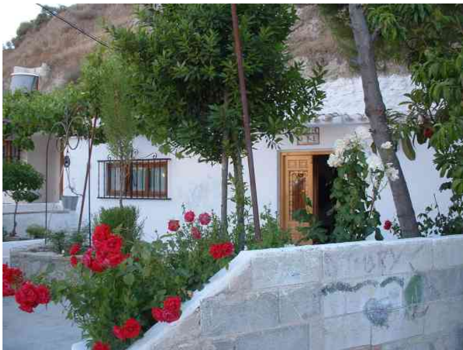
A pretty picture indeed

Residents do not pay "property income tax" on their principal or first property, only on second or third properties.