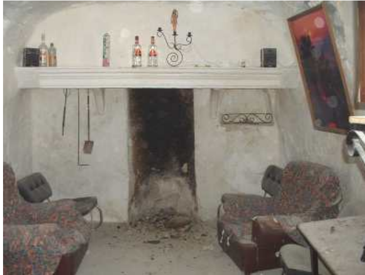
All you need here is a quick dust around!!!

Other unreformed caves may be more recognisable as a home, they have plastered walls, ill fitting doors and windows and electrical wires running through the rooms. The amount of work required to restore these cave is less than that required above but can still be a sizeable project.