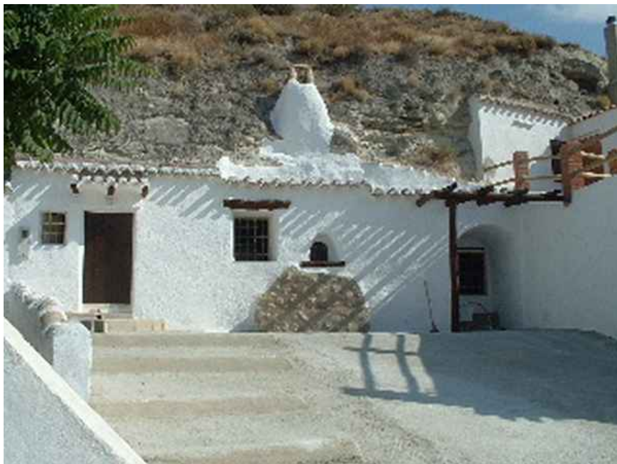
Cave houses are fantastically cool in summer and cosily warm in winter.

Caves have been mankind's home since time immemorial and we all carry in our imagination dark, wet, cold holes in the ground lived in by dirty, shivering, frightened families huddling around smoky fires afraid of the dark and frightened by real or imaginary predators skulking outside.