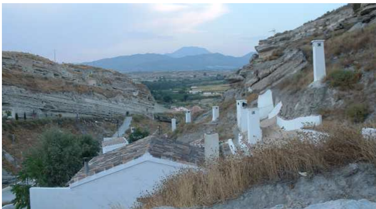
A view over Galera's cave house chimneys, looking towards the distant Sagra Mountain

The modern history of the cave homes in Spain's northern Andalusia stretches back hundreds of years. If you wander the hills and valleys surrounding Galera you will be amazed to see just how many abandoned cave houses there are. Just forty years ago almost all of these rather primitive dwellings were inhabited and it is only since then that they have been abandoned. Back then the population of Galera was about 6,000; today it is a mere 1,300. In the late sixties and seventies most of the population of Galera fled the grinding poverty of life on the land for jobs on the coast and the cities of Barcelona and Madrid.