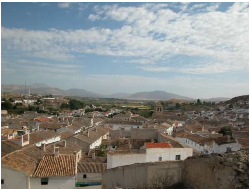
An evening sky over Galera

Take the trouble of planning and making your own travel and accommodation arrangements. This way you are free to see a number of estate agents, and if you don't like them or what they have to offer you can break away and start anew with someone else. Also, importantly you can plan some free time to visit the local attractions so that even if you do not buy a property you will have had something of a holiday. By all means book your accommodation through an estate agent, they often know the best types in the area, just so long as you have your own transport and are free to come and go as you please.