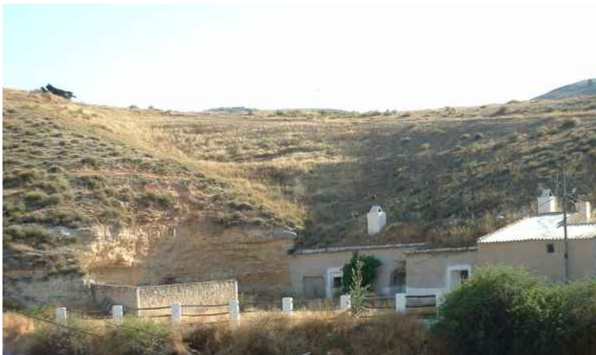
Caves nestling in the hills and evening sun