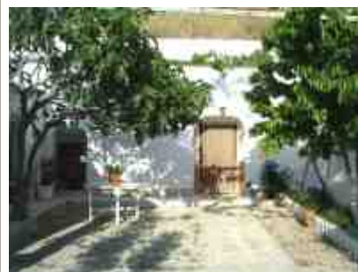
A typical Spanish style cave home

Spanish Style. Many of these continue to be lived in or have recently been lived in by Spanish families. Very often, to bring them up to a modern comfortable style they will need some renovation work, usually non structural. Normally they will require complete rewiring, some floors lowering to improve height, some changes in layout and general redecoration to suit British tastes. Some facilities, such as bathrooms may only be accessible by crossing a patio. Sometimes you can pick up a bargain but many of these cave homes are not significantly cheaper than the fully modernised ones above.