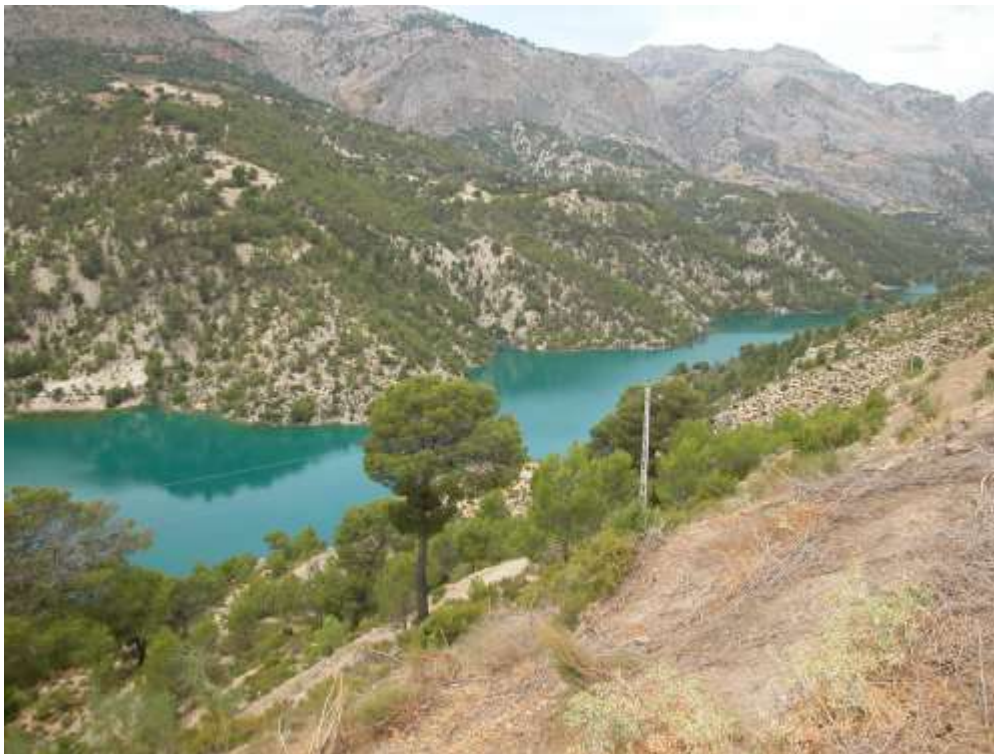
The lakes and mountains of nearby Castril

is granted by the local town or village hall, called the Ayuntamiento. Usually there is not a problem in obtaining the permissions, however some councils are more restrictive than others.