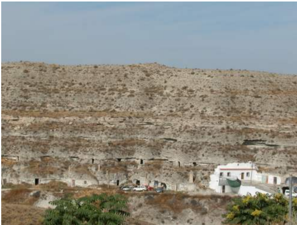
In the beginning there were old caves!